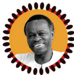
Professor PLO Lumumba Founder of The PLO Lumumba Foundation