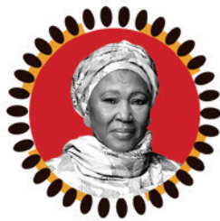
H.E. Aja Fatoumata Jallow-Tambajang Former Vice President of The Gambia