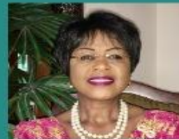
Amb Arikana Chihombori- Quao