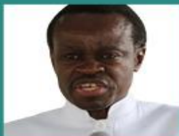
Prof PLO Lumumba